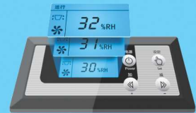
Humidity can be adjusted to as accurate as 1%