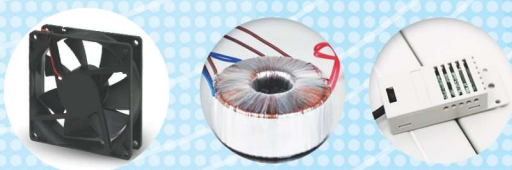
Water-proof fan, transformer and humidification sensor