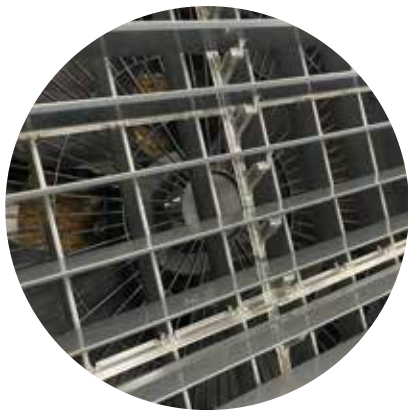
Closeable front swing