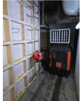
T.S.T. Shopping Mall Septic tank