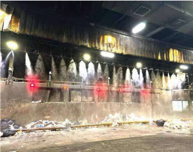
Island West Refuse Transfer Station